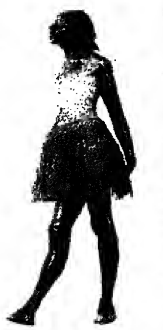
Sculpture cast after Degas's death brought $10.12 million.